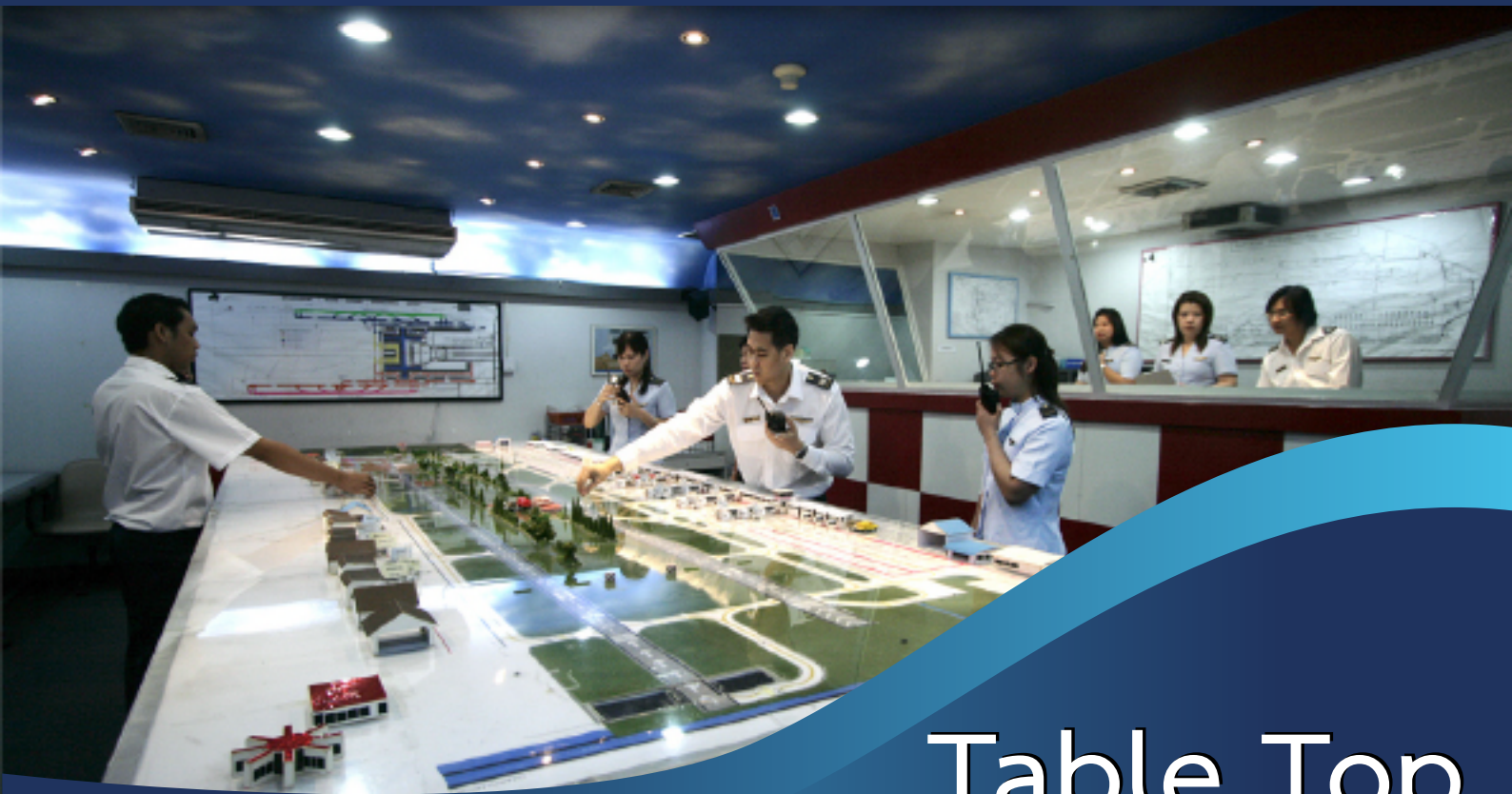
Table Top Aerodrome Control Simulator

Aeronautical Radio of Thailand Ltd. (AEROTHA) provides air traffic service and has developed table top Aerodrome Control Simulator. This simulator is not only used to train new controllers prior to be controllers but also provide familiarization and refresher training for experienced controllers to meet the International Civil Aviation (ICAO)'s standards. The simulator is