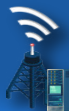
Digital Trunked Radio System : DTRS