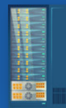
Customer Enterprise Network : CEN