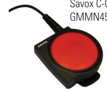
Savox C-C400 GMMN4579A

Complete the solution with the Savox C-C400 com-control unit that enables the use of your two-way radio in hazardous conditions. Designed to be especially robust for the most extreme environments, the extra-large push-to-talk button ensures transmission even when used underneath gear and protective clothing.