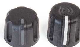
Standard Control Knob RFID Control Knob

◀ Optional colour identification bands for groups with different tasks, coverage areas or shifts