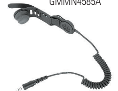
Savox HC-1 GMMN4585A

Complete the solution with the Savox C-C400 com-control unit that enables the use of your two-way radio in hazardous conditions. Designed to be especially robust for the most extreme environments, the extra-large push-to-talk button ensures transmission even when used underneath gear and protective clothing.