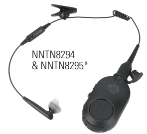
NNTN8294 & NNTN8295*

Bluetooth 2.1 audio is embedded in the radio enabling fast and secure pairing with a variety of Bluetooth accessories. Easy to attach and pair, Motorola Bluetooth accessories enhance performance and security wherever you work. Officers can talk discreetly undercover, move without wires and use their radio like never before.